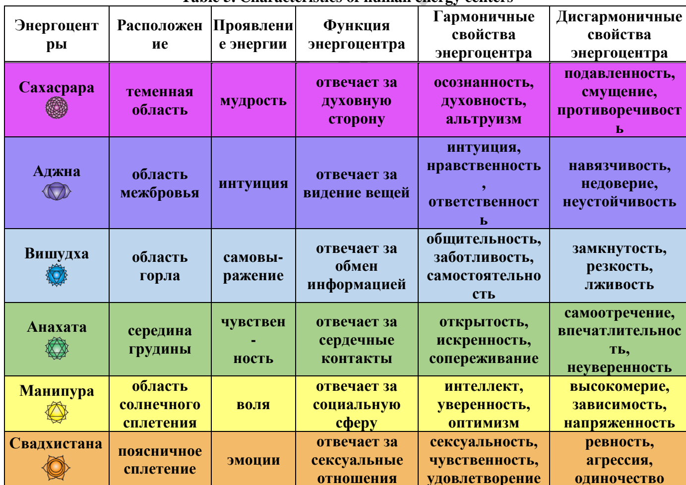
Table 5. Characteristics of human energy centers

Let's substantiate our assumption about the effect of committing sin/virtue on the functioning of the chakra, which, as a result, is able to change the size and color of a person's aura. In the table. Figure 5 shows the characteristics of the chakras in terms of energy.