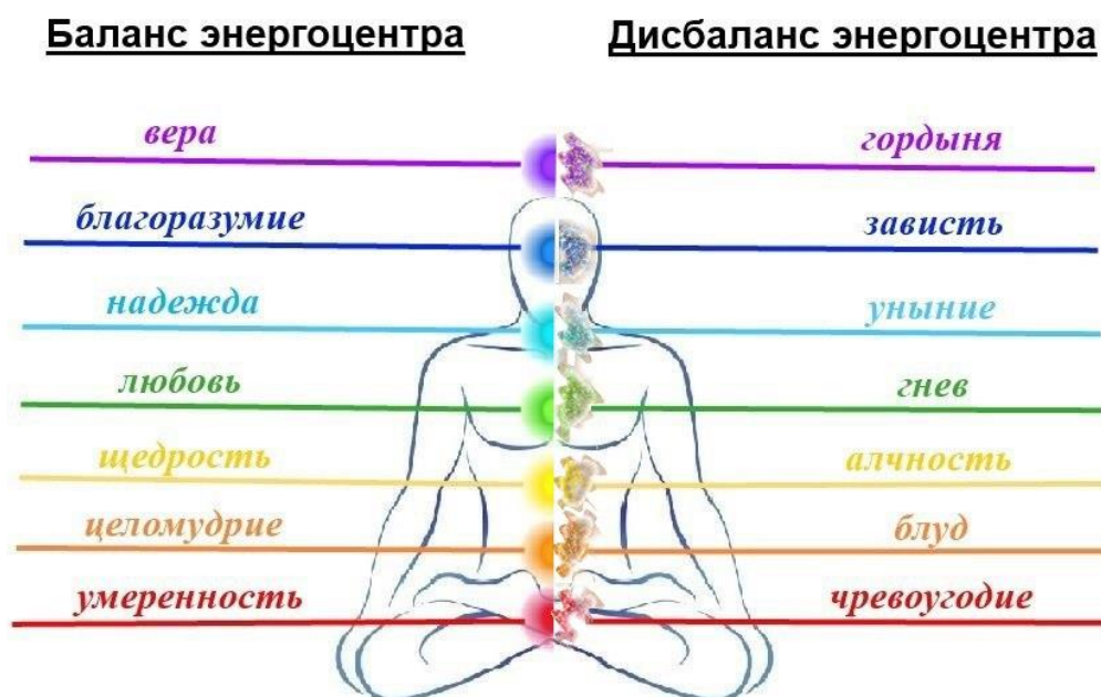
Fig.1. The manifestation of sin/virtue through the chakras

To understand the relationship between the color of the aura and the purity of the chakra, consider an example. Let's say we're looking at a man with an orange aura. This suggests that the energy of sensuality is most pronounced in the 2nd chakra. This means that a person can be emotional, creative, but also touchy and dependent on others. All this leads to the search for pleasure or peace as some kind of meaning in life. This is how sin and virtue manifest themselves at this stage of life in this particular person. And the main task for him now is to choose a path and follow it for further growth — either to lose himself in passion or to be restrained in emotions.